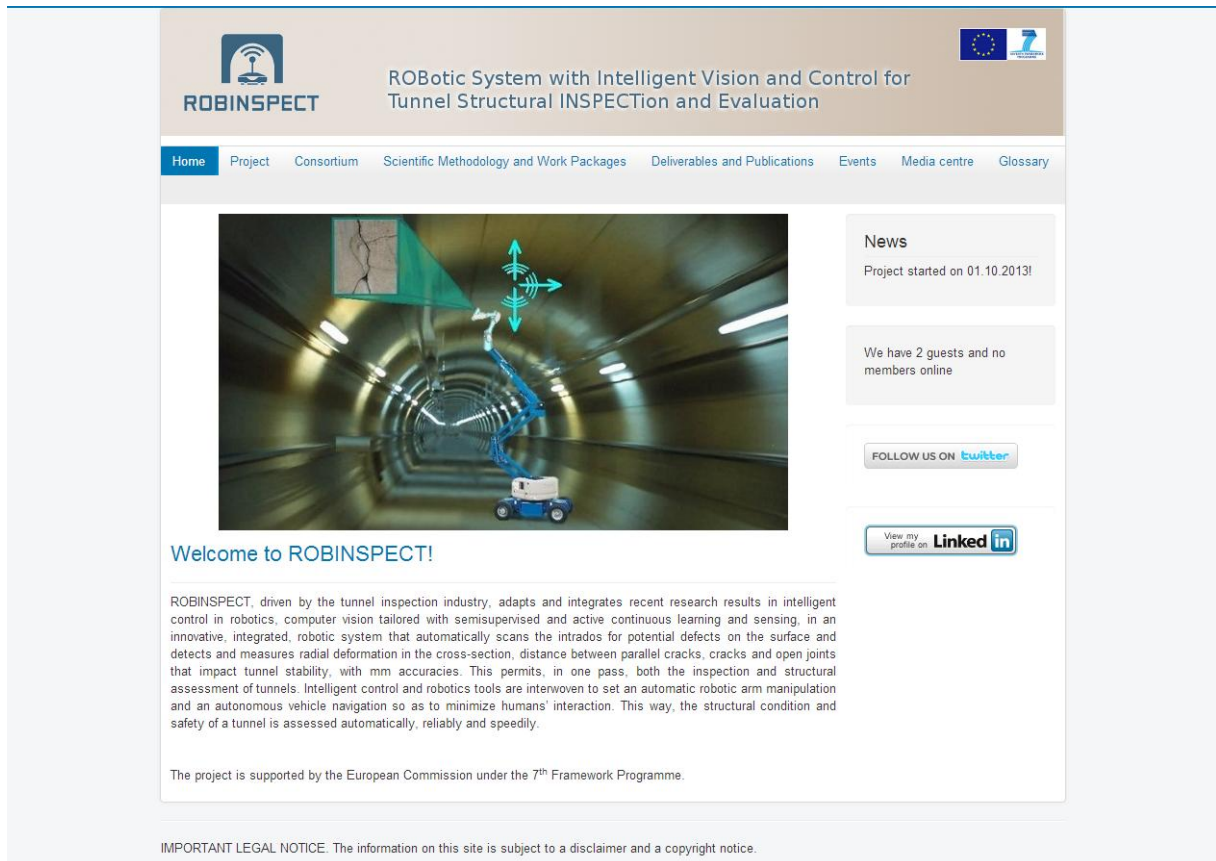
Figure 1:Home page