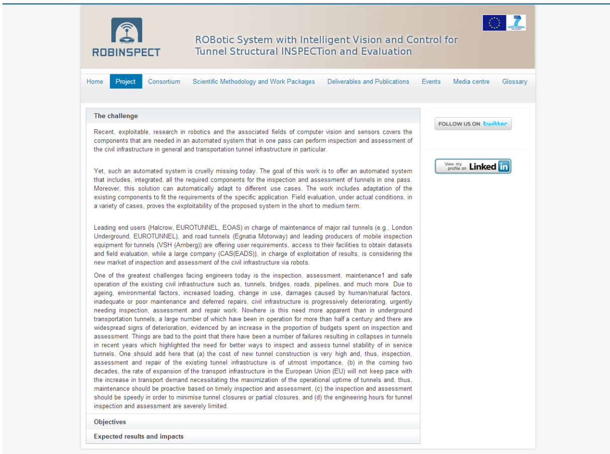
Figure 2:Project page